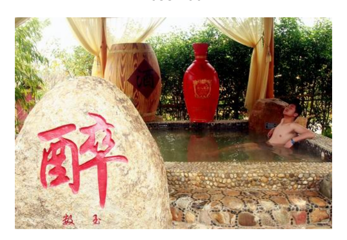
Chinese Alcohol Pool