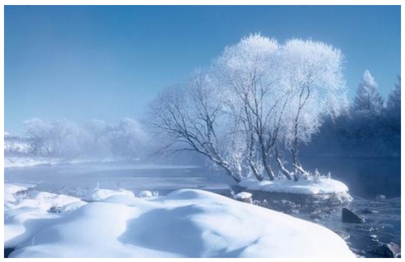
View of Harbin